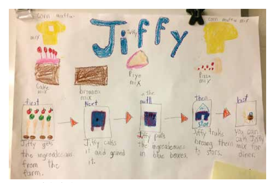
Figure 1: Draft Flier for the Economics Project

Our approach, tailored for the primary grades, followed several of the typical