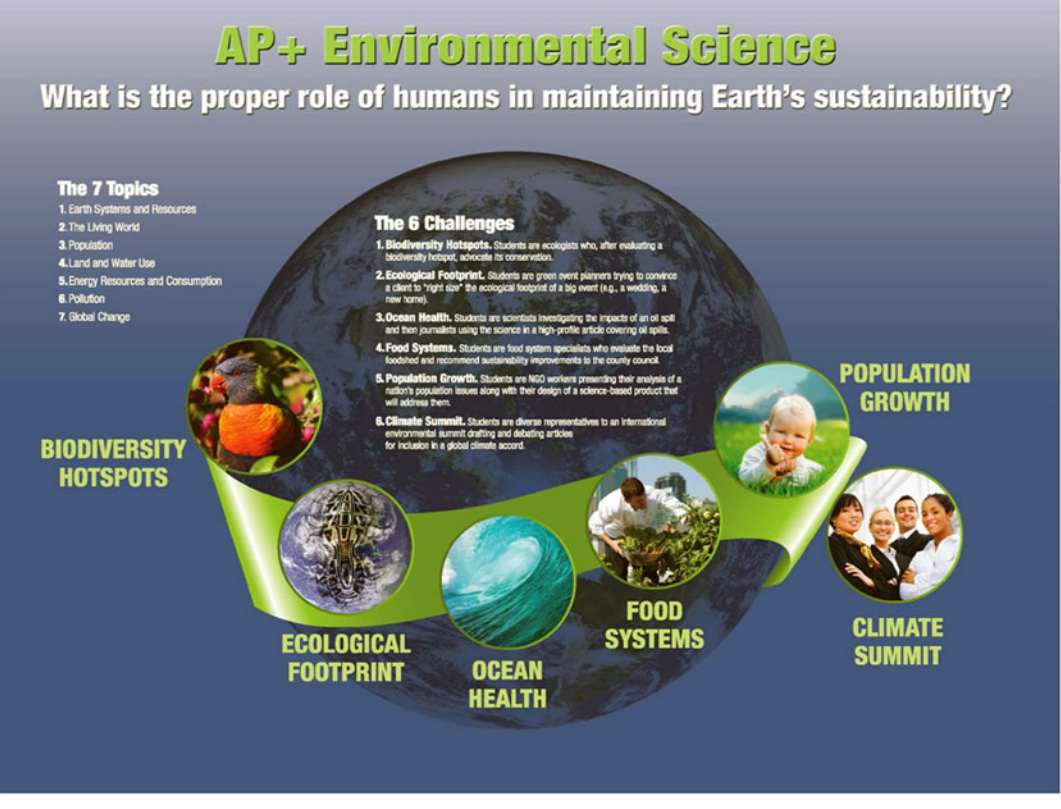
Figure 1. The course poster for the project-based APES course in Year 1.

that AP courses be redesigned to better support student learning (Parker, Mosborg, Bransford, Vye, Wilkerson, & Abbott, 2011, National Research Council, 2002).